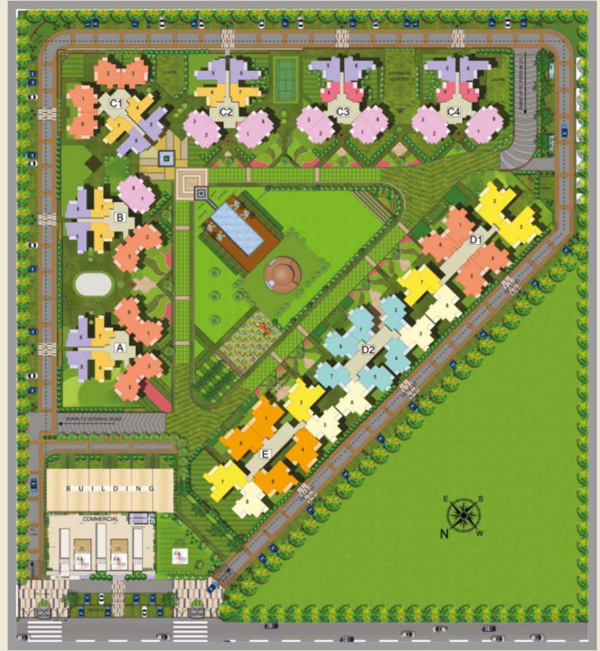
Site Layout Map