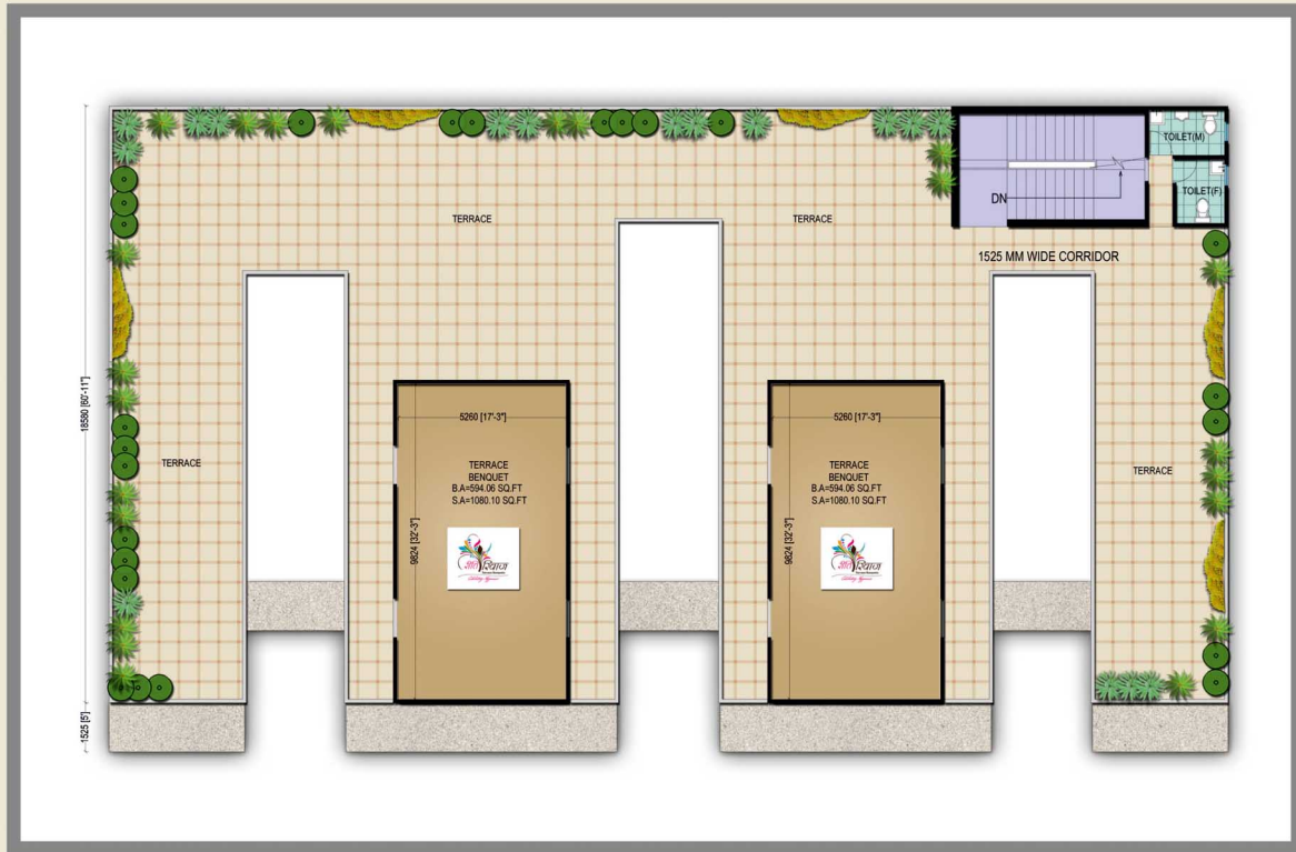
Upper Ground Floor Plan