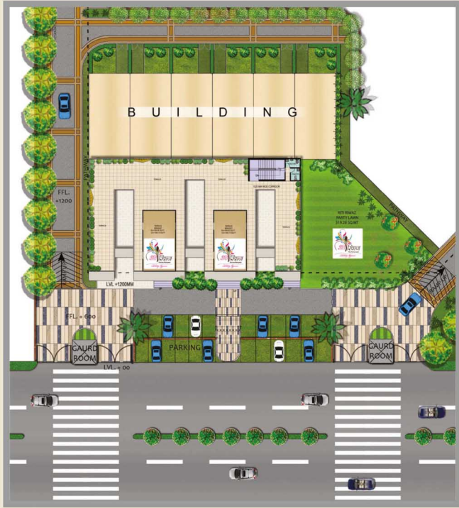
Commercial Layout Plan